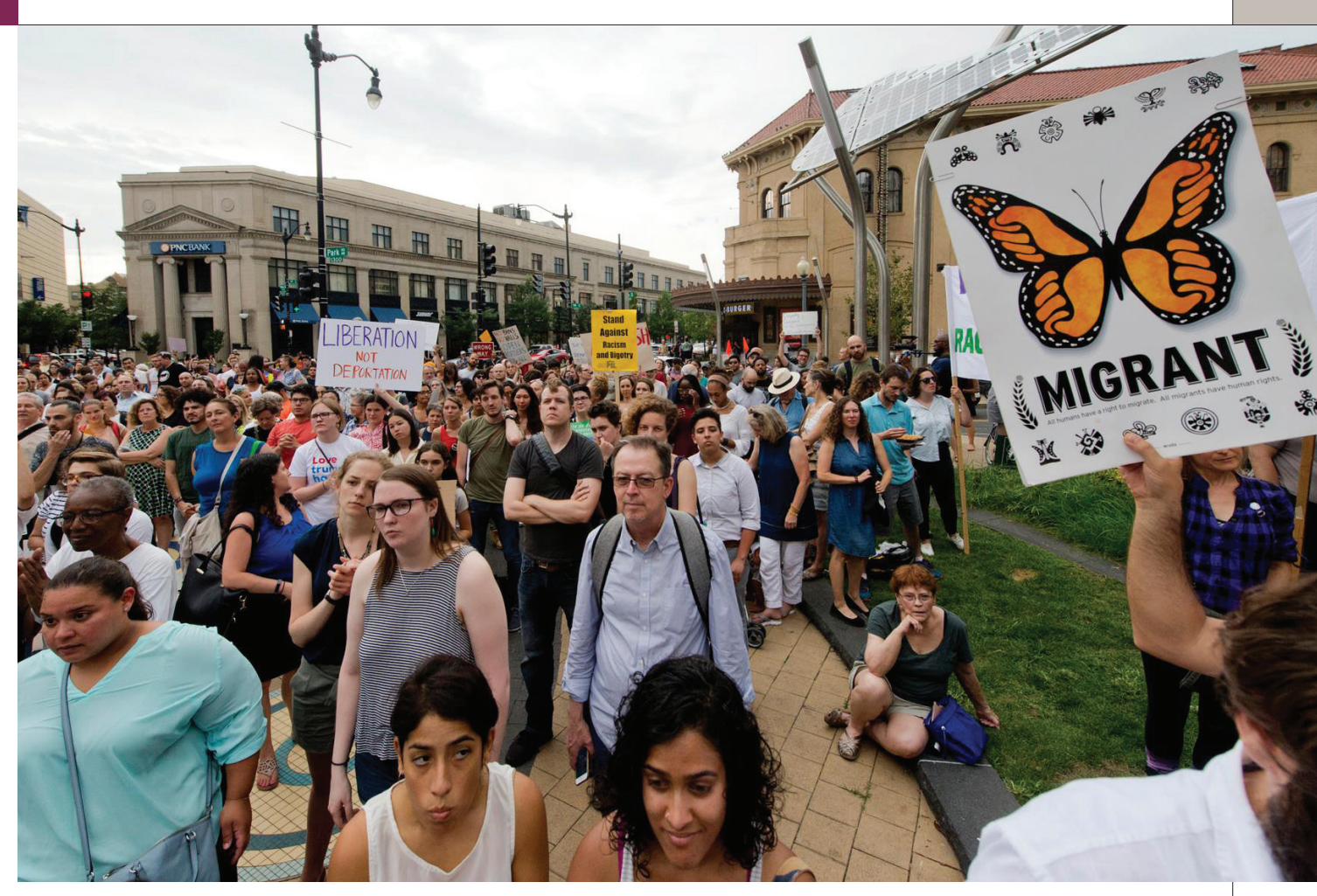
In the current political moment, there remains frustration and uncertainty regarding the District's commitment to both its sanctuary policies and its noncitizen population.

PHOTO CREDIT: BRANDON WU, SANCTUARY DMV - JULY 17, 2019