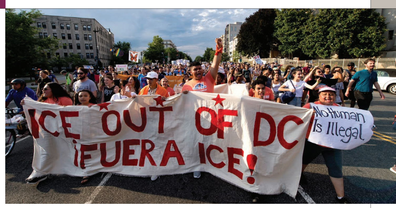
The District of Columbia, the nation's capital, has publicly stated to residents that it is a Sanctuary City. However, for the reasons discussed in this report, the District continues to carry out policies that support ICE in detaining noncitizens in the District.