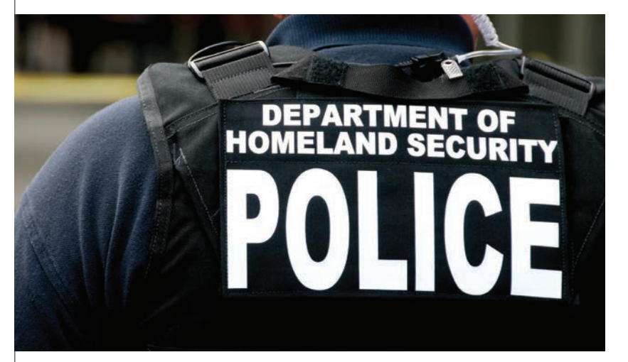
The U.S. Department of Homeland Security created automatic biometric data-sharing pathways with local and federal agencies to identify deportable noncitizens through the Secure Communities program.

The adverse impact of detainers on families and communities has led numerous local jurisdictions to enact policies impeding the ability of their LEAs to cooperate with federal immigration authorities.<sup>23</sup> Furthermore, various federal courts have found that it is unlawful for local and state LEAs to hold individuals based on ICE detainers beyond when they are otherwise ordered released.<sup>24</sup> As discussed more fully below, jurisdictions are determining for themselves the degree of cooperation with ICE that is permissible within the law. Among the stated reasons to limit cooperation with ICE are concerns about further toxifying the relationship between immigrant communities and local police and liability due to potential constitutional violations.<sup>25</sup>