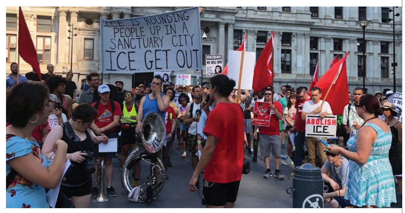
D.C. residents have repeatedly shown support for the District's noncitizen population, and have called for strengthened sanctuary policies.

A fundamental problem with the District of Columbia's current approach towards sanctuary policies is passivity and complacency with norms that exist in writing, but which often fail to offer meaningful protection. By not taking affirmative steps against ICE practices, the District is allowing its residents to become targets and its families to become victims. A more robust approach involves ensuring that information does not get into the hands of ICE, and that residents have information about instances of cooperation, and can file complaints when sanctuary policies are violated.