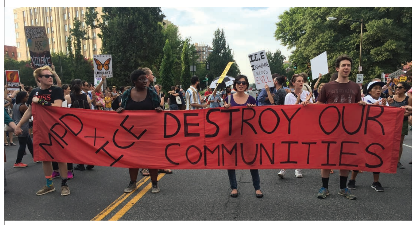
Cracks in MPD and DOC policies and practices allow ICE to access noncitizens, undermining the District's push to be a sanctuary jurisdiction.

While various agencies in D.C.'s criminal legal system have paid public lip service to not working with ICE, their policies and practices often fall short of fully protecting noncitizens. Local media, attorneys, and activists have all reported that failures in D.C.'s sanctuary policies arise from a convergence of the following factors: cracks in sanctuary policies linked to MPD and the D.C. Department of Corrections, federal agency involvement in local affairs, and a lack of leadership and accountability from the Mayor's office.